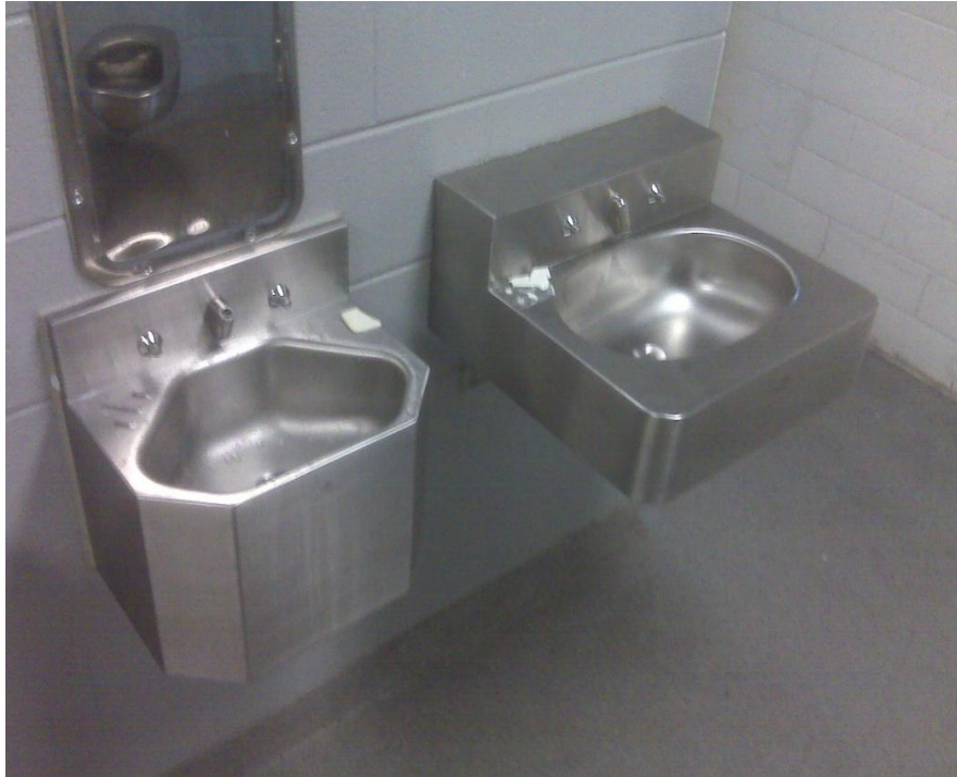
Plaintiff's Exhibit _