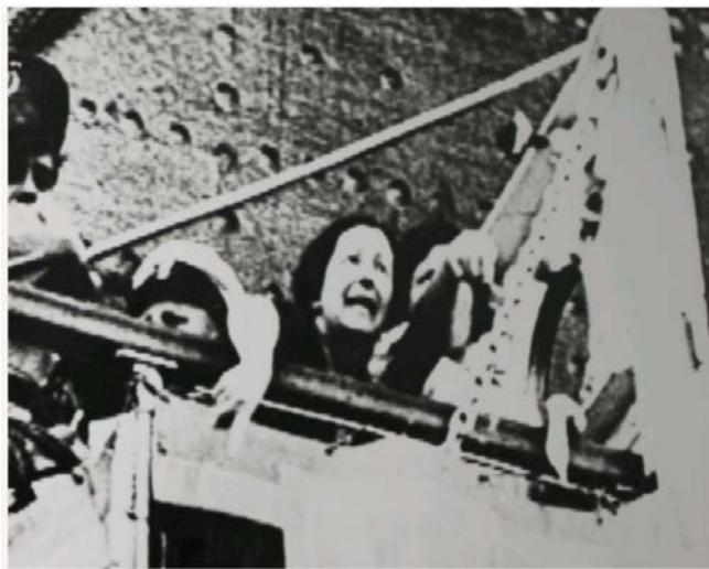
A woman cries as the St. Louis pulls away from Havana, 1939. | Keystone-France via Getty Images

Source: "Map Showing the Voyage of the St. Louis, May 13-June 17, 1939.", American Jewish Joint Distribution Committee Archives, "The Story of the S.S. St. Louis (1939)"; http://archives.jdc.org/educators/topic-guides/the-story-of-the-ss-st.html (Last visited February 5, 2017).