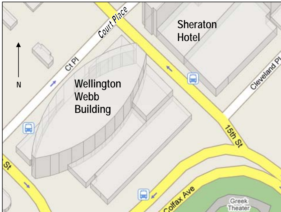
Figure 1.0: Map of area

38. Shortly after 7 p.m. on August 25, 2008, a march began in Civic Center Park. The marchers left Civic Center Park from the Greek Amphitheatre and marched down 15 th Street toward Court Place. The marchers did not have a permit. Some of the marchers were in the street; others marched only on the sidewalks.